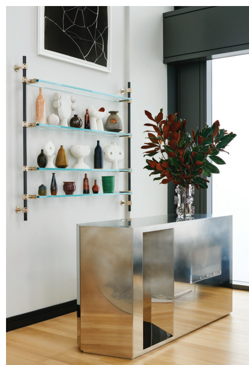
↳ Custom bar and shelving by Amuneal , Ammonite paint by Farrow & Ball , vase by Lorin Marsh , pottery by Humble Matter , vintage pottery from Maison Gerard , art by Tara Donovan from Pace Gallery .