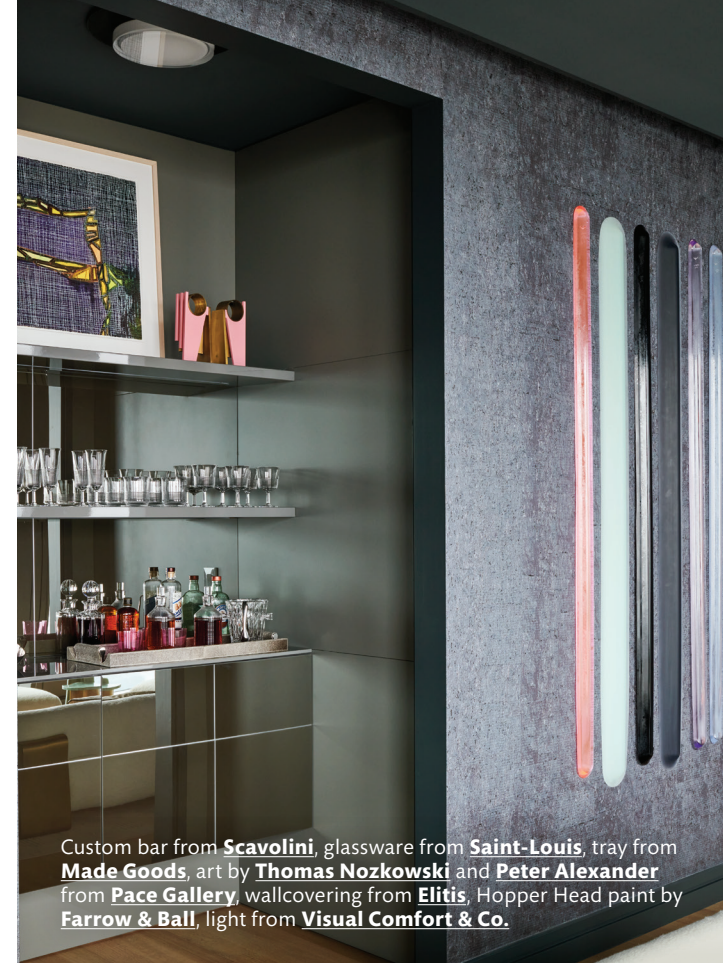
Custom bar from Scavolini , glassware from Saint-Louis , tray from Made Goods , art by Thomas Nozkowski and Peter Alexander from Pace Gallery , wallcovering from Elitis , Hopper Head paint by Farrow & Ball , light from Visual Comfort & Co.