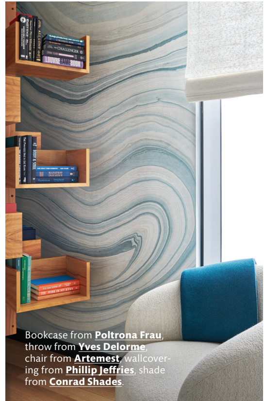
Bookcase from Poltrona Frau , throw from Yves Delorme , chair from Artemest , wallcovering from Phillip Jeffries , shade from Conrad Shades .