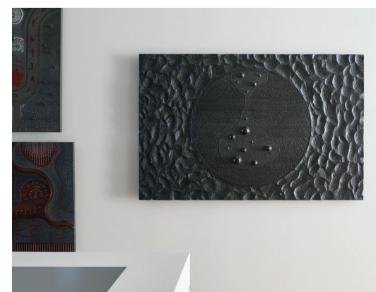
↳ Panels by Caleb Woodard , Ammonite paint by Farrow & Ball .