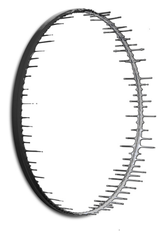
BLACK / SILVER