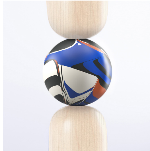
White Oak / Lemur