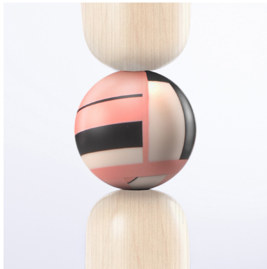
White Oak / Flamingo