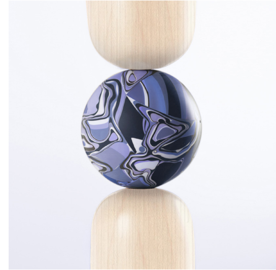
White Oak / Physalia