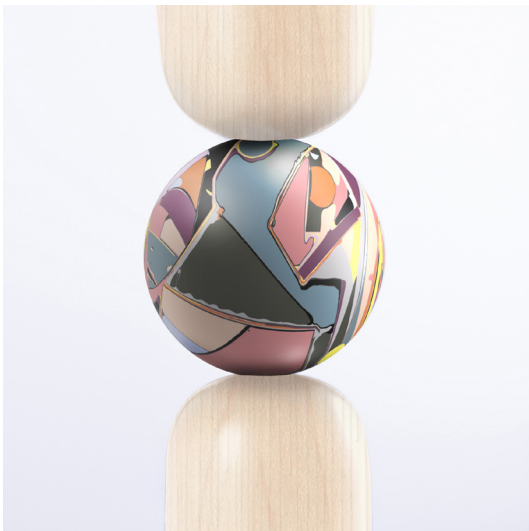
White Oak / Chameleon