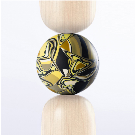
White Oak / Python