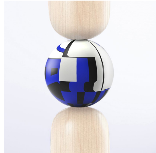
White Oak / Morpho