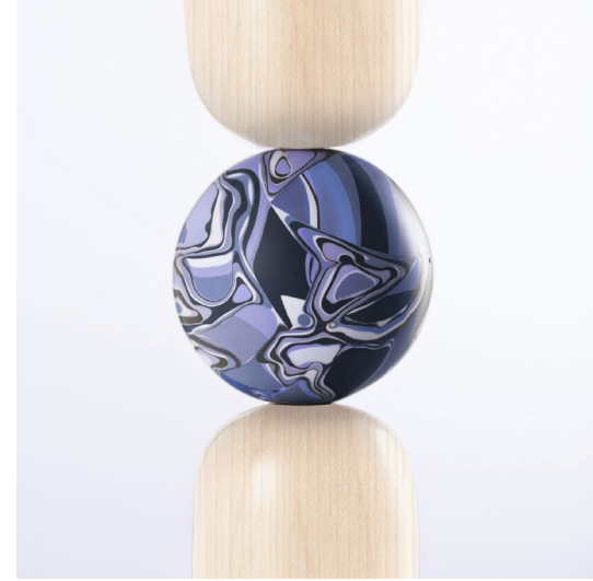
White Oak / Physalia